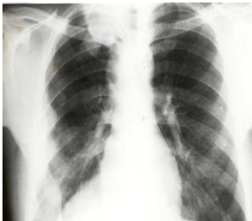
Fig. 3 X-ray chest showing reduction in size of the pleural masses.