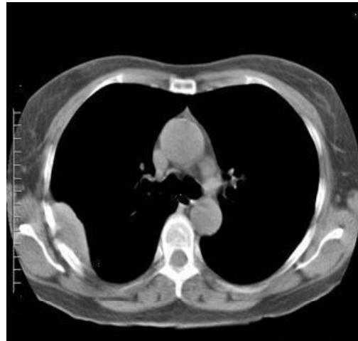
Fig. 2: CT scan of the chest demonstrating a pleural mass.